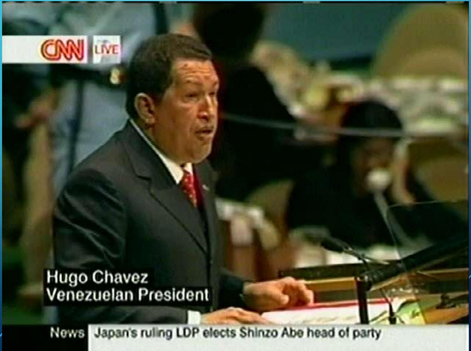
Hugo Chavez Venezuelan President

News Japan's ruling LDP elects Shinzo Abe head of party